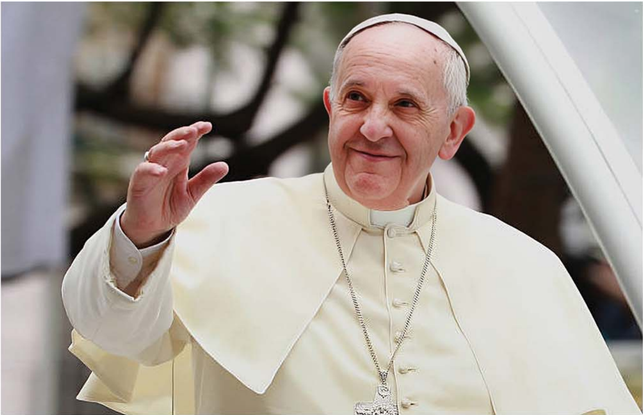
"If an infant or the weak is safe, there Christ is served" : Pope Francis.