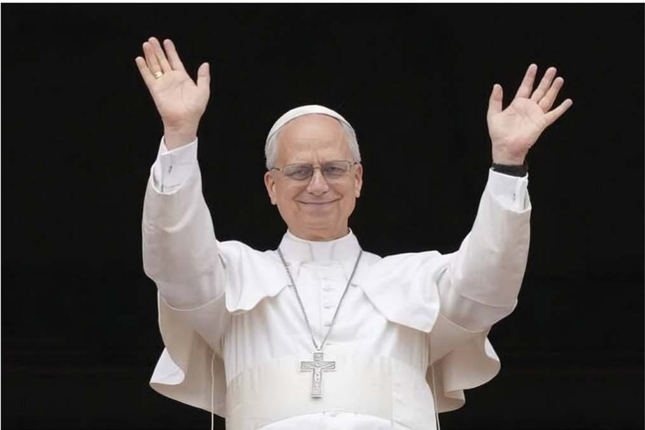
"Peace be with you all" : Pope Leo XIV