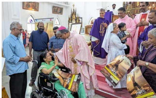
Lenten Campaign and 'Chetana' Disability Campaign 2025 @ DSSS Level